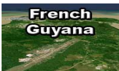
French Guyana HiRes Tiles