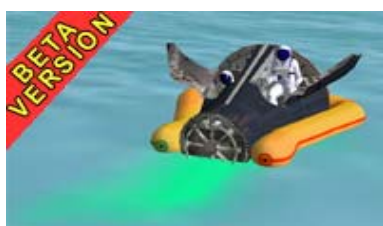
Improvement for Gemini