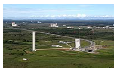
Kourou-ELA HiRes Tiles