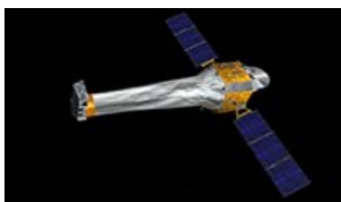
Chandra Telescope and I.U.S.