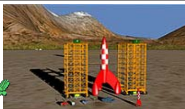
Tintin on the Moon