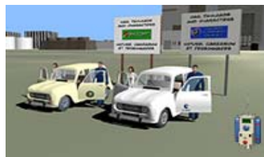
Spacecraft vs UCGO-UMmu