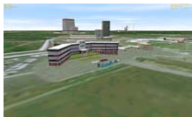
Kourou - CSG (part 1 & 2)

and here are my two last recent add-ons :