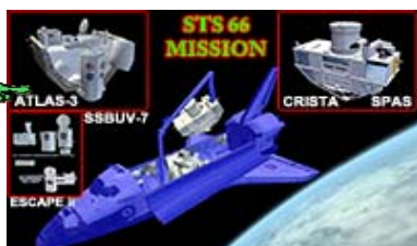
Crista-Atlas set for STS66 mission