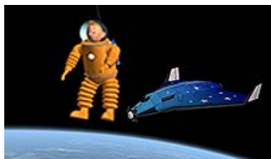
UMmu - Tintin