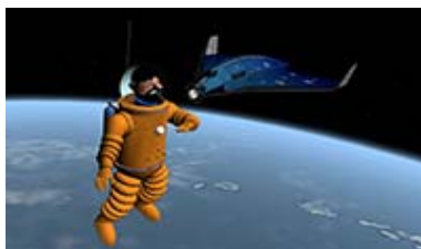
UMmu - Haddock