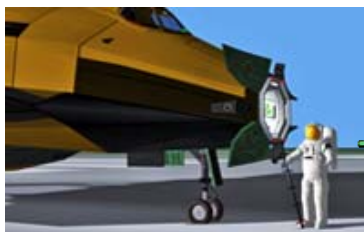
Ladder for the DGIV