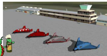
Tintin Skins for the DG-IV

Click here to get to my download page on Orbit Hangar... Click here to get to my download page on Pappy's Hangar (French)